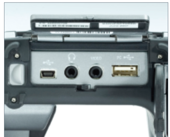
From Left to right: USB mini for PC image download, 4 pole audio for voice annotation, NTSC video, USB-A for memory stick image transfer

Optional Add-on optics, Telephoto lens, 15° Optional Add-on optics, Wide angle lens, 45° High temperature option (up to +1200°C (2192°F)) 12 volt auto adapter Hip/Belt mounted camera holster Neckstrap USB-A for memory stick